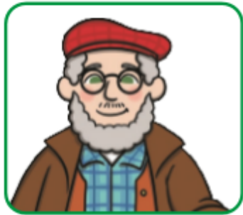
The man has a red hat.