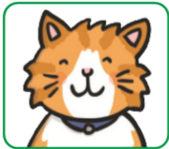
The cat has a bell.