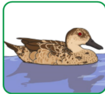
37 The duck has a dip.